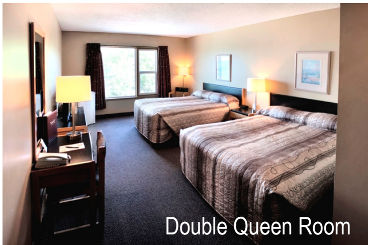
Double Queen Room