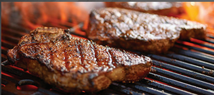
8 oz New York Steak

Homemade, breaded ribs or wings. Choose buffalo, BBQ, hot, lemon pepper, honey garlic or Greek 15.95